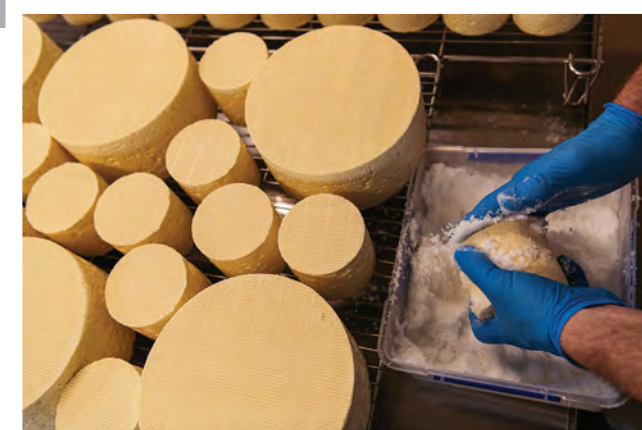
Top: And the compliance goes on... Above: Salting the cheese