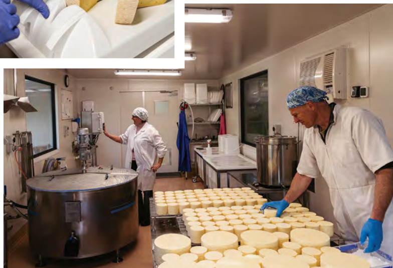
Below: Salting the cheese in the creamery.