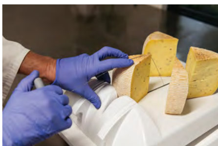
Left: Cutting the cheese.