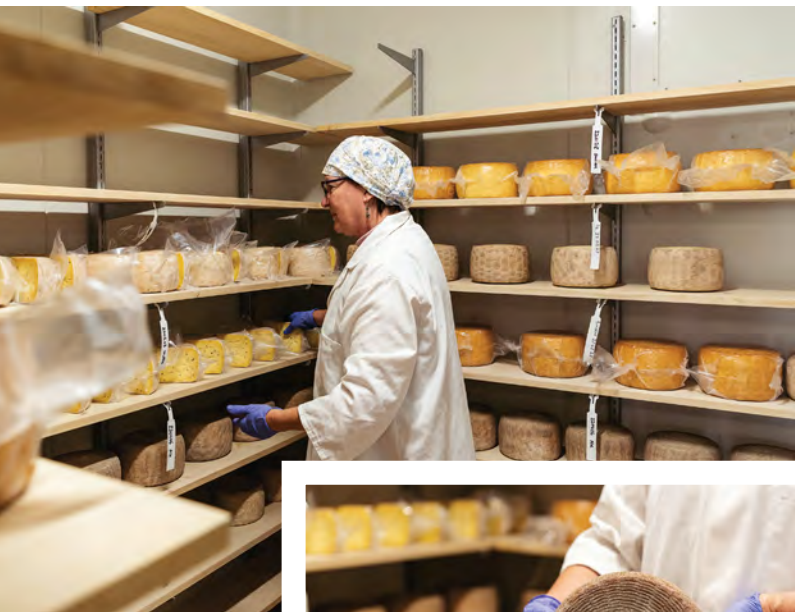
Above: Shhh: cheese is maturing.