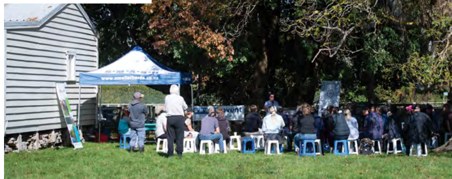
SMASH field day under the beautiful autumn colours with cheese passarounds. What could be better?

the history of agriculture is what Kiwi farmers do, and have always done, well, he said.