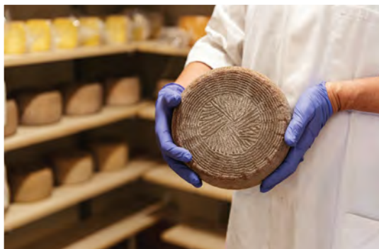
Right: Selecting the rounds at the Cartwheel Creamery.